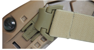
RAIL ATTACHMENT BAR