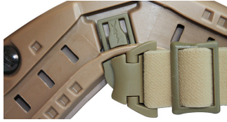
RAIL ATTACHMENT CLIP

The ARC RAS makes it possible to integrate Wiley X goggles into your helmet rail system. The ARC RAS includes two short straps with two clips and two bars to give a perfect fit for most of the ARC helmet rails available on the market.