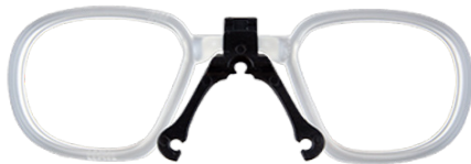
WEIGHT (WITHOUT PRESCRIPTION LENSES): 3 GR

Insert a prescription carrier into the goggles for corrected vision behind high impact protection.